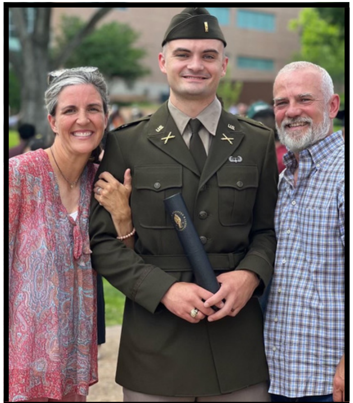
Now 2LT at graduation with his parents.