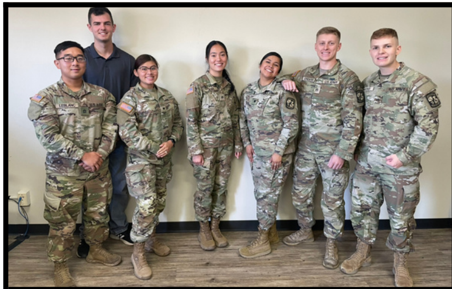
These are just a few of our SMP Cadets.