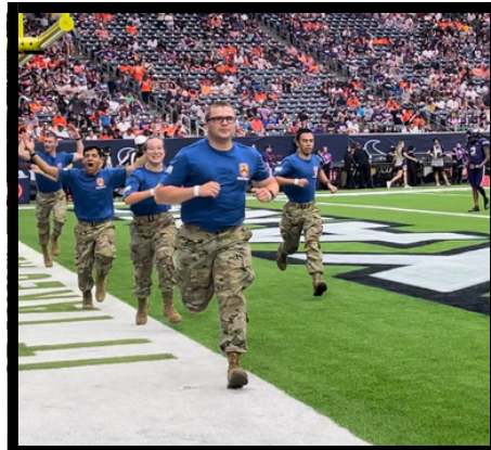
Push-up Crew at the Battle of the Piney Woods.

Push-up crew is an excellent opportunity for cadets to become more active in the program. When there is a game, the push-up crew cheers on and supports the players by doing push-ups for every touchdown they score.