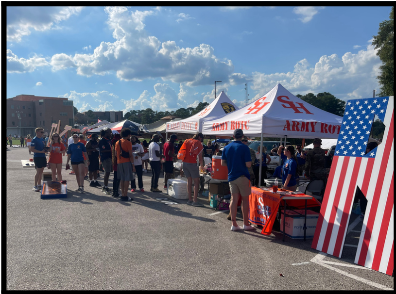
Tailgating at the SHSU V. Northern Arizona game.

The Bearkat Battalion tailgate's provide an opportunity to foster camaraderie within our current Cadet cohort, Alumni mentorship, and encourage community outreach and positive influence. Through our freshly cooked food, games, and connection outside of ROTC hours; we strive to enjoy our time spent together. Come out to an ROTC tailgate, and get to know the future leaders of America!