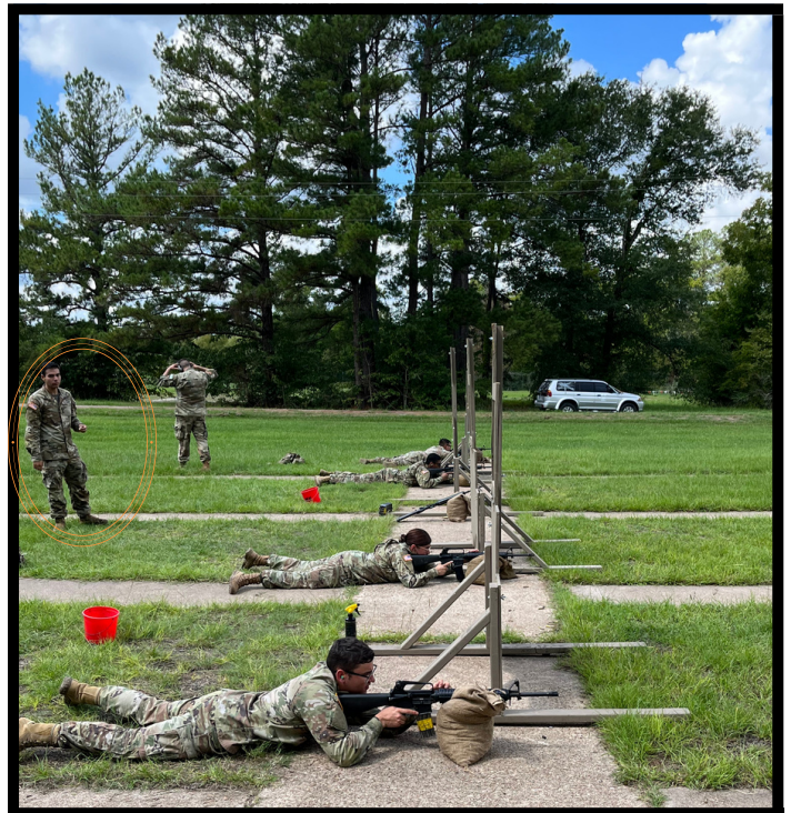
CDT Pilgrim leading the BRM training at the Huntsville Police Department Range.